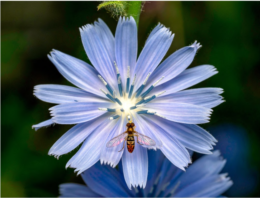
4th place - Syrphidae