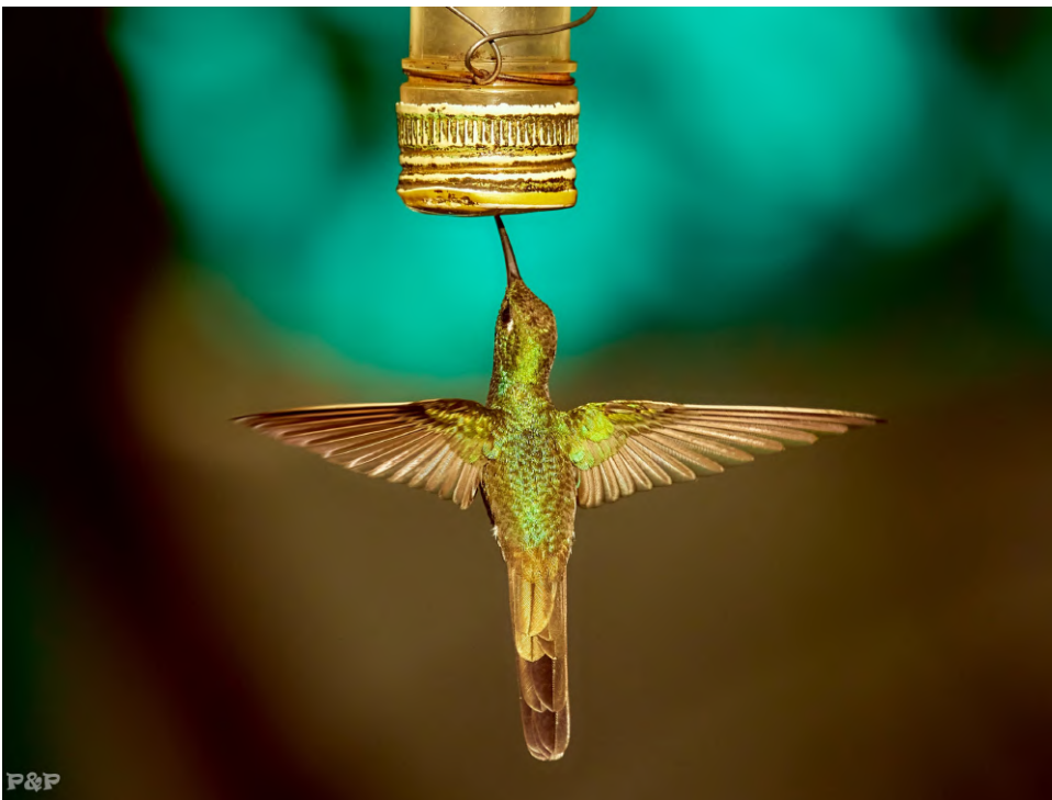
1st place - Cuban Emerald