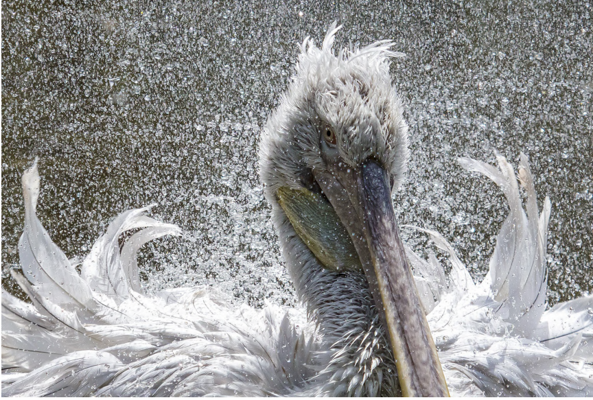
2nd place - Pelican Dance