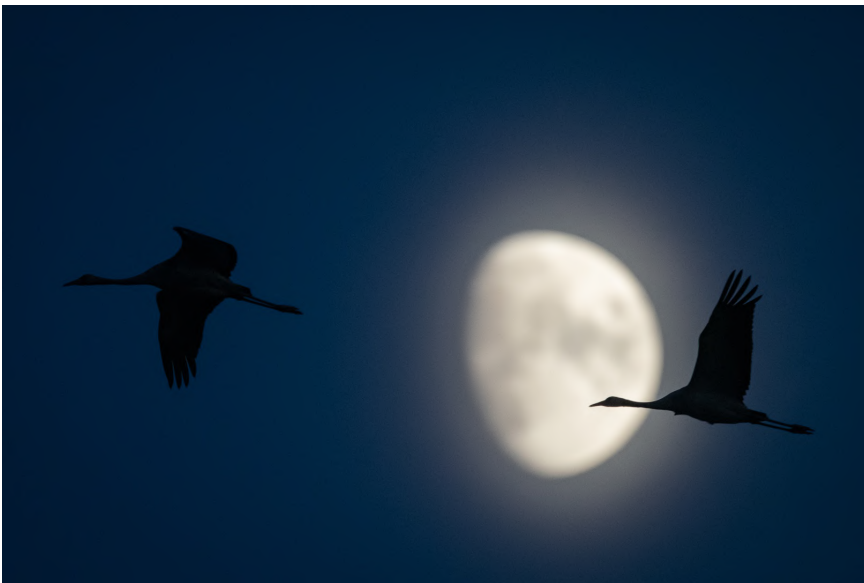
3rd place - Passing By