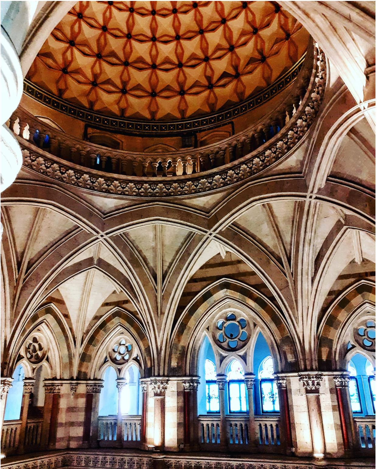
Victorian Gothic architecture inside the iconic BMC HQ Mumbai